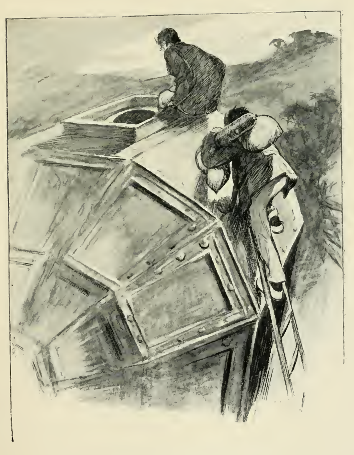
"I sat across the edge of the manhole and looked down into the black interior"