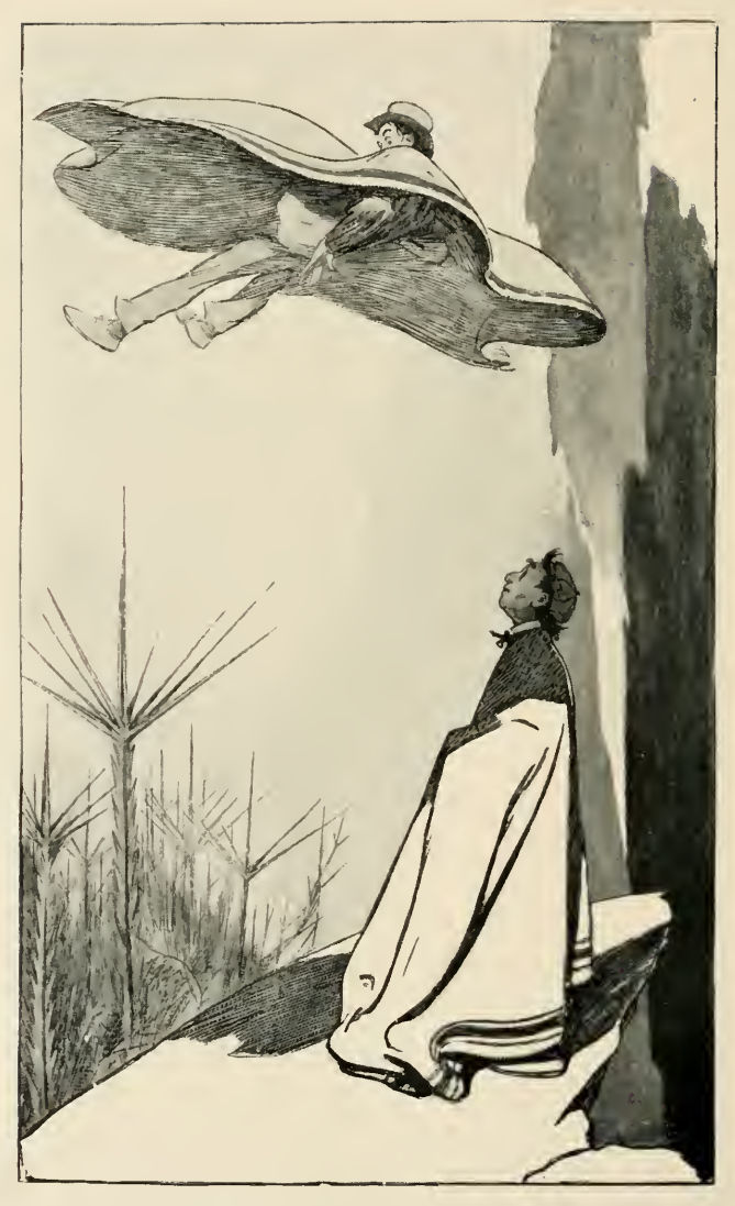
"I realised my leap had been too violent"