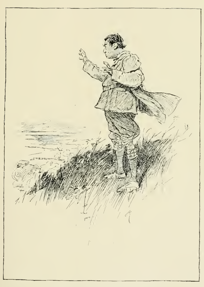
" He gesticulated with his hands and arms "