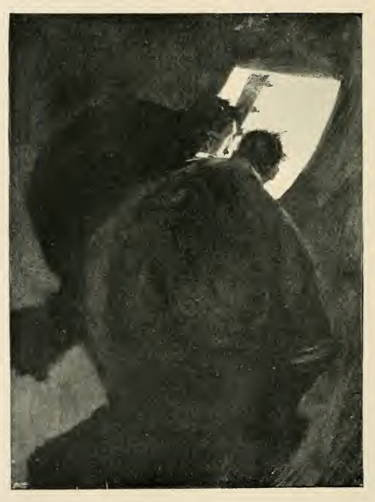
" We watched intensely