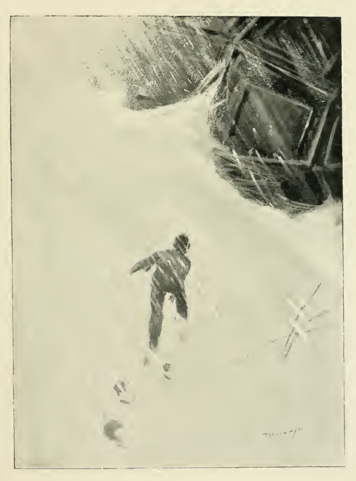
^{\prime\prime} The nearer I struggled, the more awfully remote it seemed ^{\prime\prime}