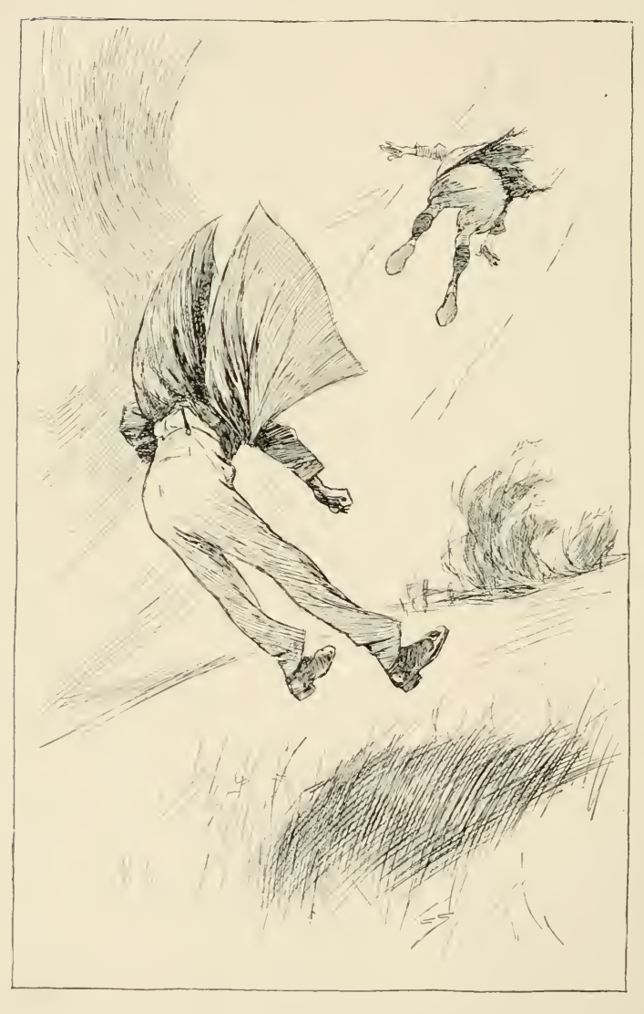
^{\prime\prime} I was progressing in great leaps and bounds " \ensuremath{\textit{Frontispiece}} .