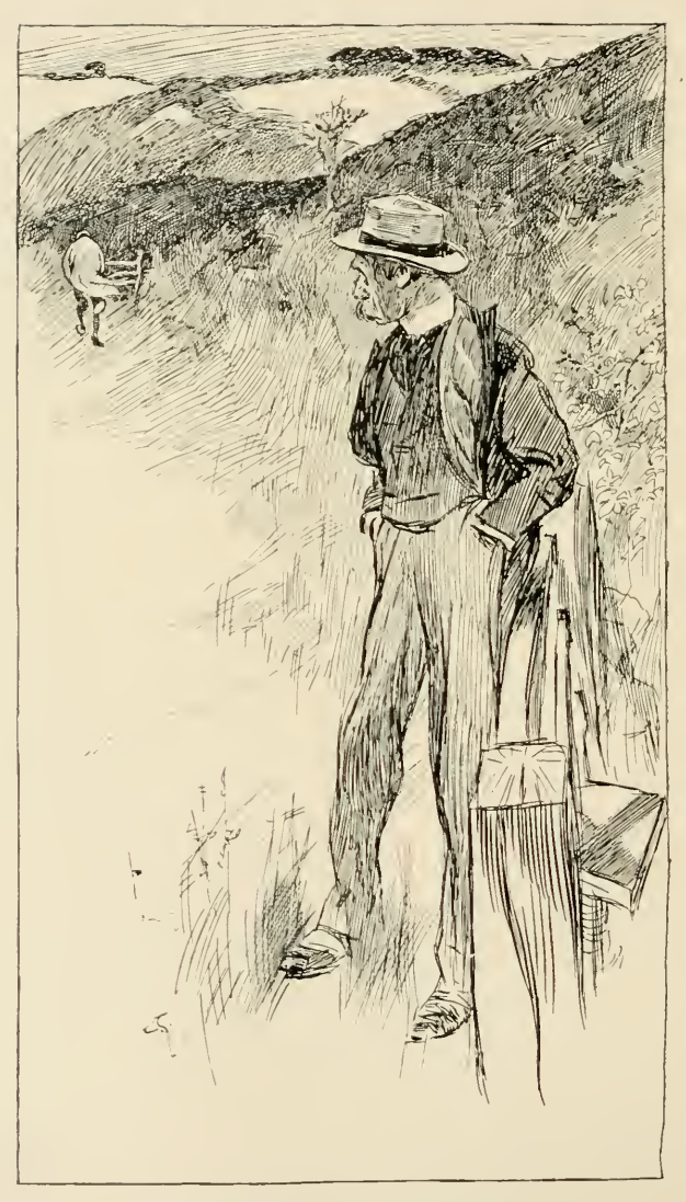
"I looked back at his receding figure"