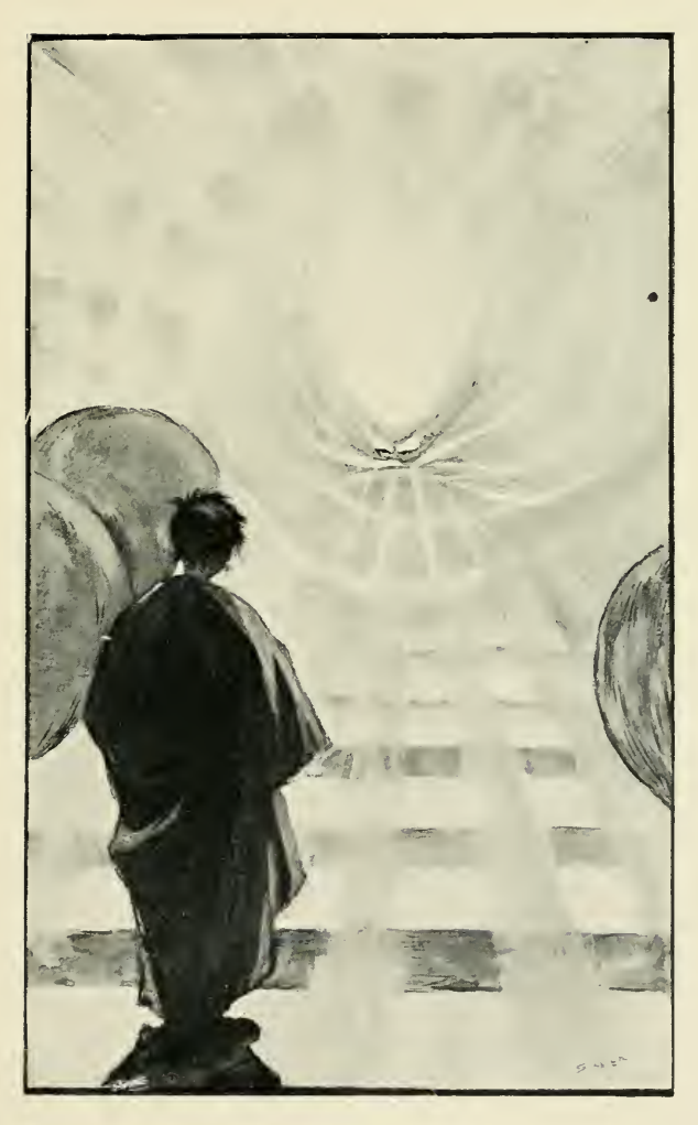
THE GRAND LUNAR