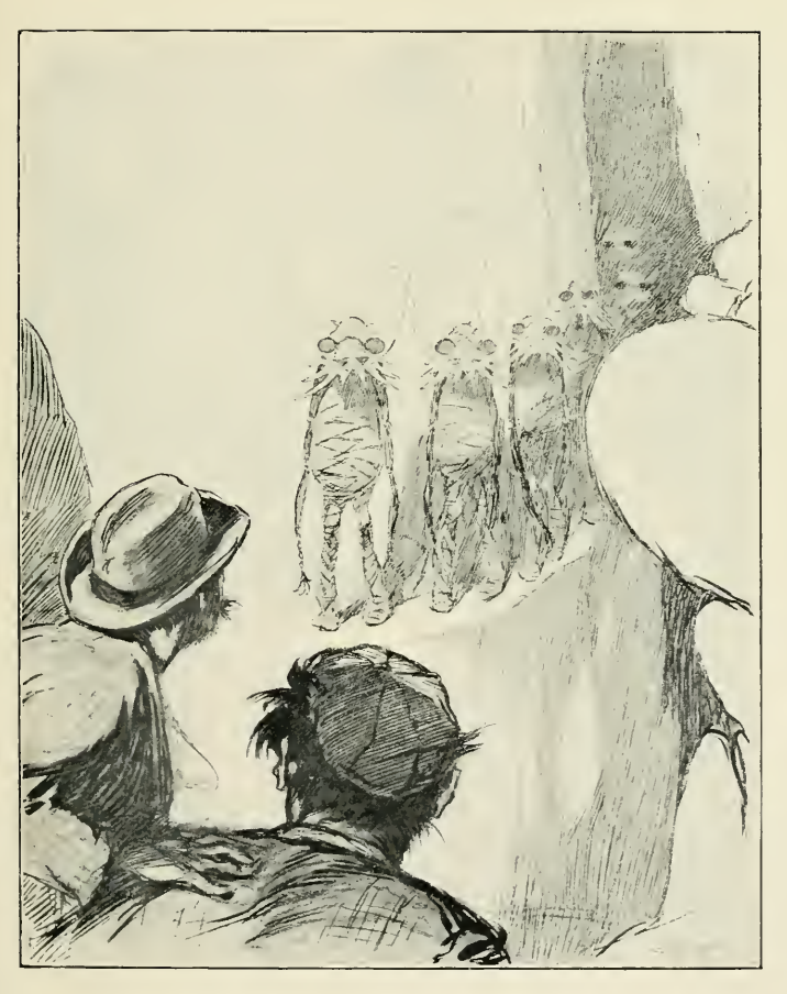
"Insects," murmured Cavor, "insects"