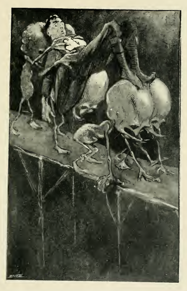
"They carried him into darkness"