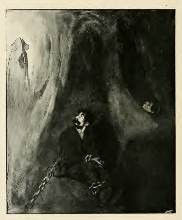
"There the thing was, looking at us"